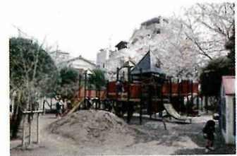
屋根裏部屋を追加 / Adding an attic.