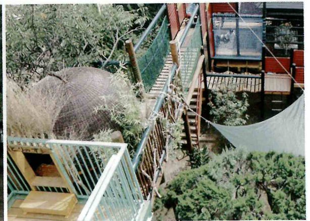
園舎とつながり、回遊性のある大きな遊びの空間ができた / Connected to the garden building, a great circuit of playgarden activities is created.