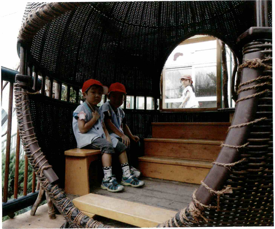
鳥の巣 / Bird's Nest