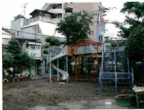
以前の園庭：既存の鉄製遊具 / Former Playgarden: Existing iron playgarden equipment