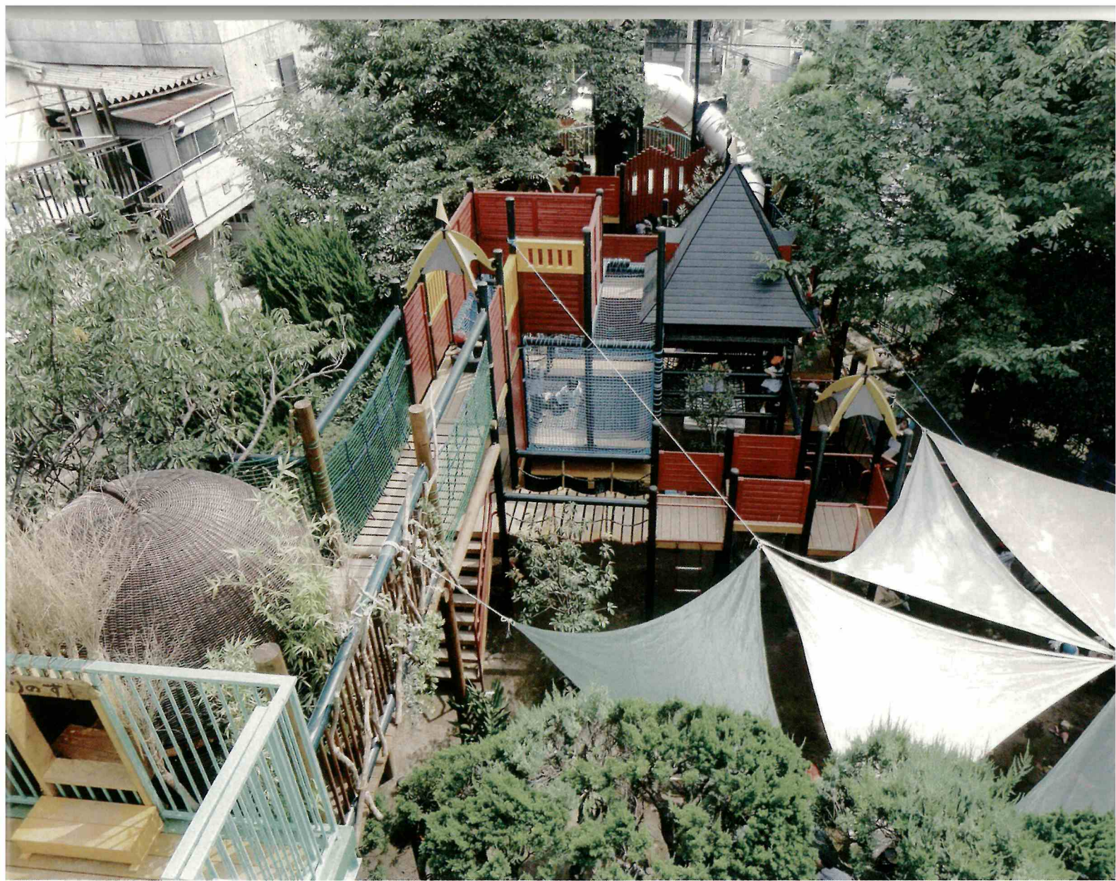
大森みのり幼稚園 東京都大田区 Omori Minori Kindergarten [Ota-ku, Tokyo]